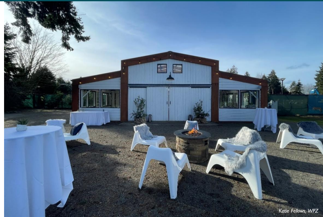
Katie Fellows, WPZ

Levy Restaurants food and beverage minimum: $1,500 Plus, $350 delivery & setup fee. Additional rental equipment (tables and chairs) is available for a fee