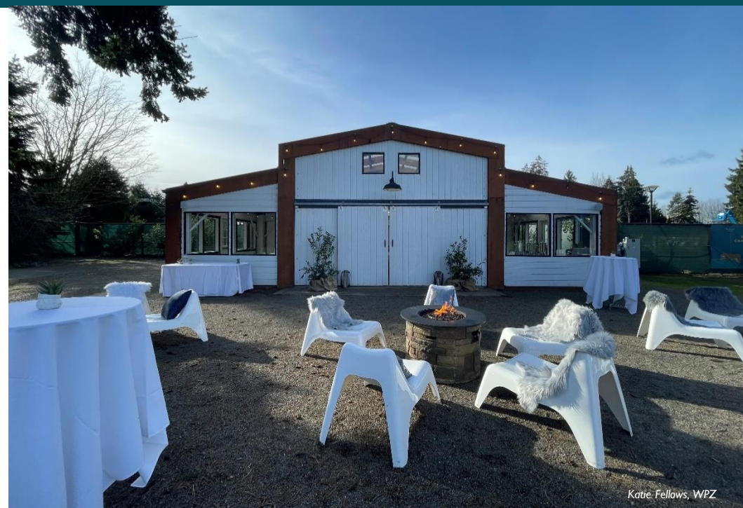
Katie Fellows, WPZ

Levy Restaurants food and beverage minimum: $1,500 Plus, $225 delivery & setup fee. Additional rental equipment (tables and chairs) is available for a fee