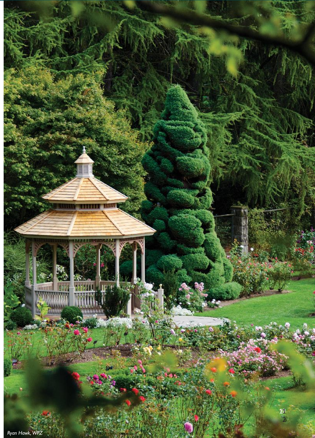
Photo permits for the Rose Garden are issued on an extremely limited basis and will not be issued on Saturdays or Sundays. Speak with your Sales and Event Coordinator before setting up a photography session on zoo grounds in conjunction with your wedding.

In the Rose Garden, a photo permit is not required with the rental of the space for a ceremony, as is it included in the rental fee. However, photo permits can be issued for groups not hosting a ceremony at the zoo.